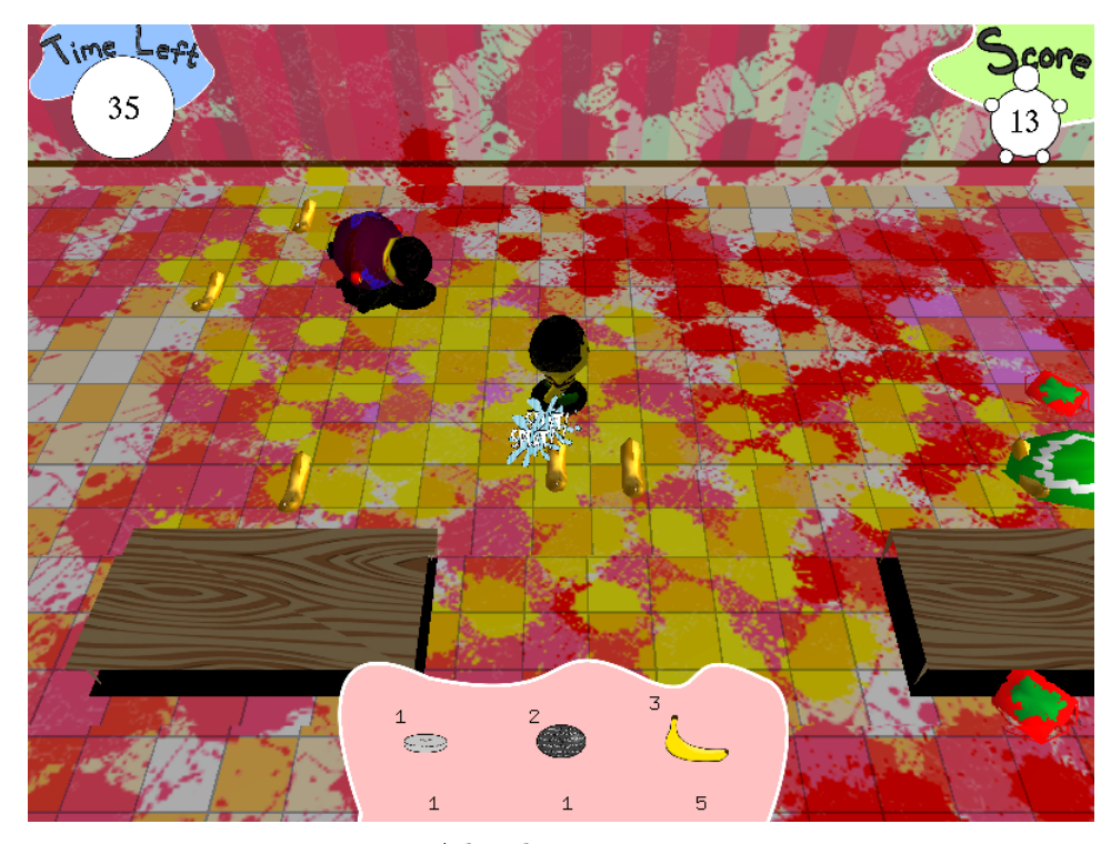
A big, big mess.

then stored, before being set to the exact dimensions of the actual wall texture. An orthographic projection is then set, with the bottom-left at (0,0), and the top-right at (texture width, texture height). This assures that the world and viewport coordinates are the same. The Model View matrix remains as an identity matrix. At this point, the coordinates of the food's collision with the surface are transformed into the texture coordinates, and the splat is painted directly onto the texture.