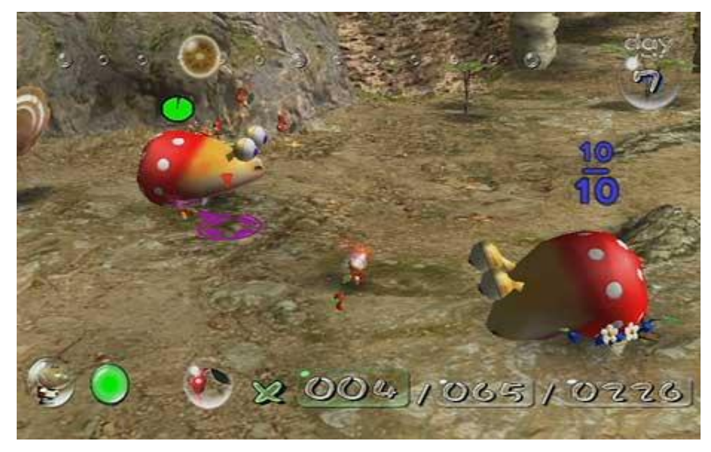
Pikmin carry a defeated enemy back to base.

to accumulate points, which could be used to obtain more minions that could then be used to defeat more enemies. This cycle of defeating enemies in order to get points, which were in turn used to defeat more enemies, was a good one, and was the basis for the point system used in Food Fight.