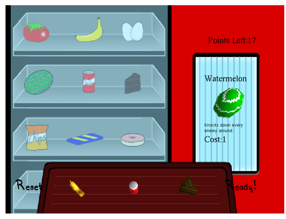
Food Selection Screen