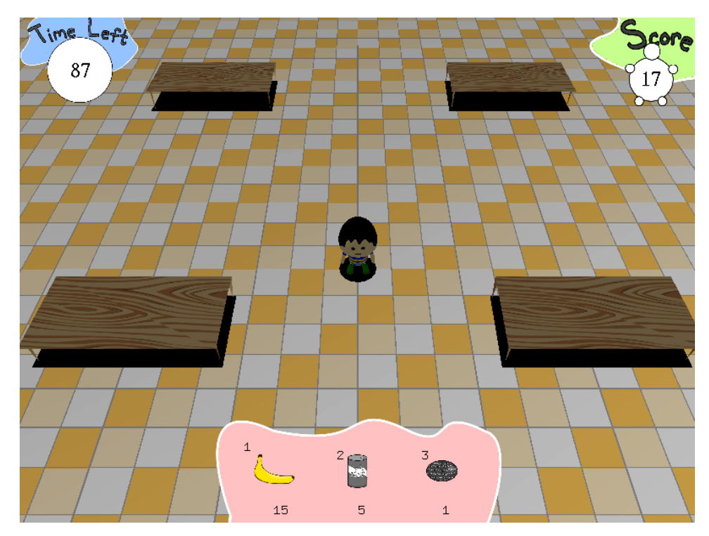
The Game Begins!