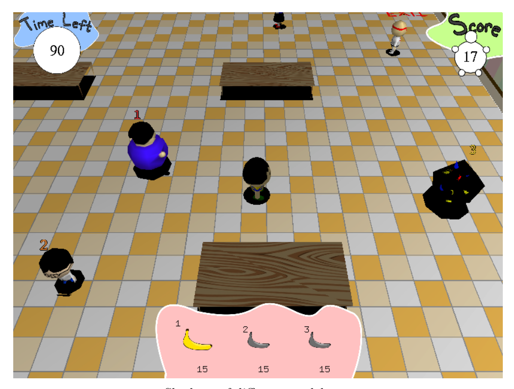
Shadows of different models