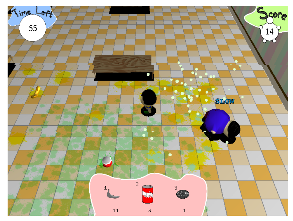
An enemy is knocked over.