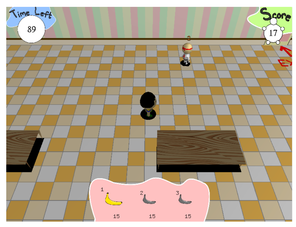
The Karate Kid, unsuspecting

The 0-360 degree range is achieved by using a second reference vector (1,0,0) in order to determine whether or not the angle between the vectors is obtuse. Once the angle of each vector is known, a simple calculation tells us whether or not the angles are within 90 degrees of each other, and consequently whether the colliding object is approaching from the back or the front.