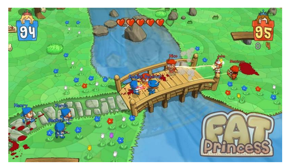
Fat Princess' game play.

Fat Princess by Titan Studios, for the Playstation 3 was a major influence on the concept and graphical style of Food Fight. Fat Princess is an incredibly fun and involving game, with beautifully simple graphics and simple but fun gameplay.