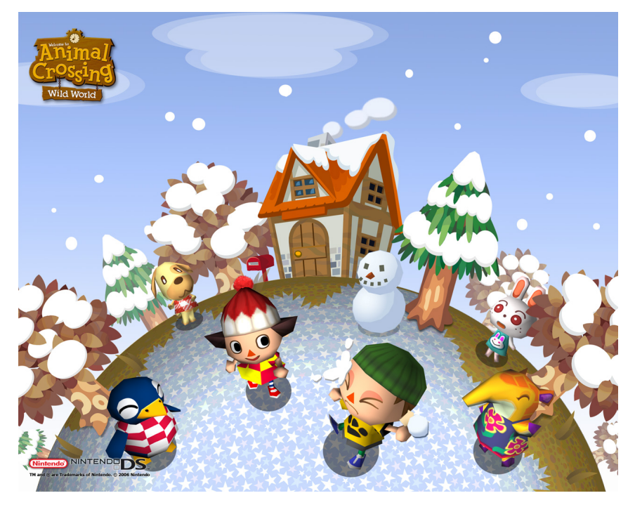
Animal Crossing's visual style.

Nintendo's Animal Crossing for the Nintendo Gamecube, as well as it's predecessor for the Nintendo DS, were also very influential on the graphical style of the game. Animal Crossing's style of completely cartoon-ish art, without the explicit use of cel-shading, created a fun but surprisingly realistic look that Food Fight attempted to emulate.