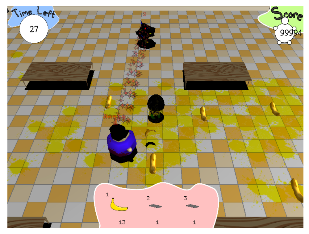
A wizard casting haste on a fatty

The distance between the two objects is calculated. The distance between each particle is then calculated according to the total number of particles in the effect. A cursor is placed at the origin object, and is then moved incrementally along the line, placing particles as it goes. Each particle's position is displaced by a pattern function before being drawn. The pattern function for the healing effect is a simple sin function, while the function for the haste effect is a translation upwards by a set radius, followed by a rotation by an increasing angle around a vector equal to the effect's original line, creating a spiral effect.