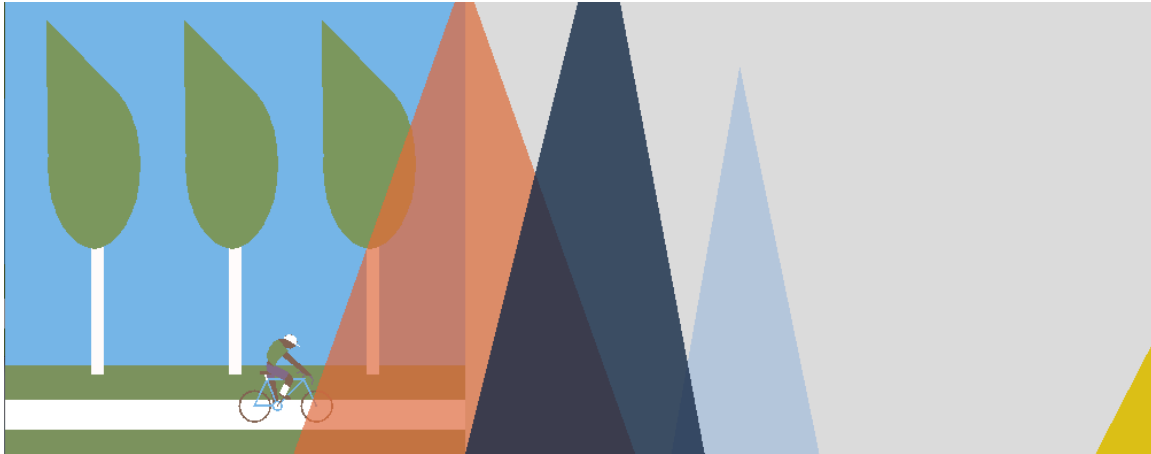
Figure 1: A frame near the start of the animation, showing the combined Blexbolex sketches (note the diver hasn't entered the animation yet).

You and your partner are required to handin a final image and your final sketch code using polylearn. Be sure that your code has your name and your partner's name as a 'comment'. You and your partner will also be demoing your solution in lecture or lab.