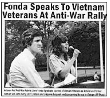
1.1971 - John Kerry preparing to speak at an antiwar rally in Mineola, N.Y.

2.1972 - Jane Fonda at a Vietnam War protest in Miami Beach.