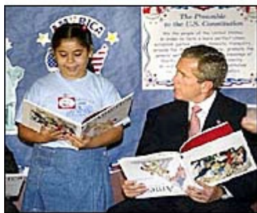
WRONG WAY - An Associated Press photograph of President Bush, top, was altered to show the book upside down.